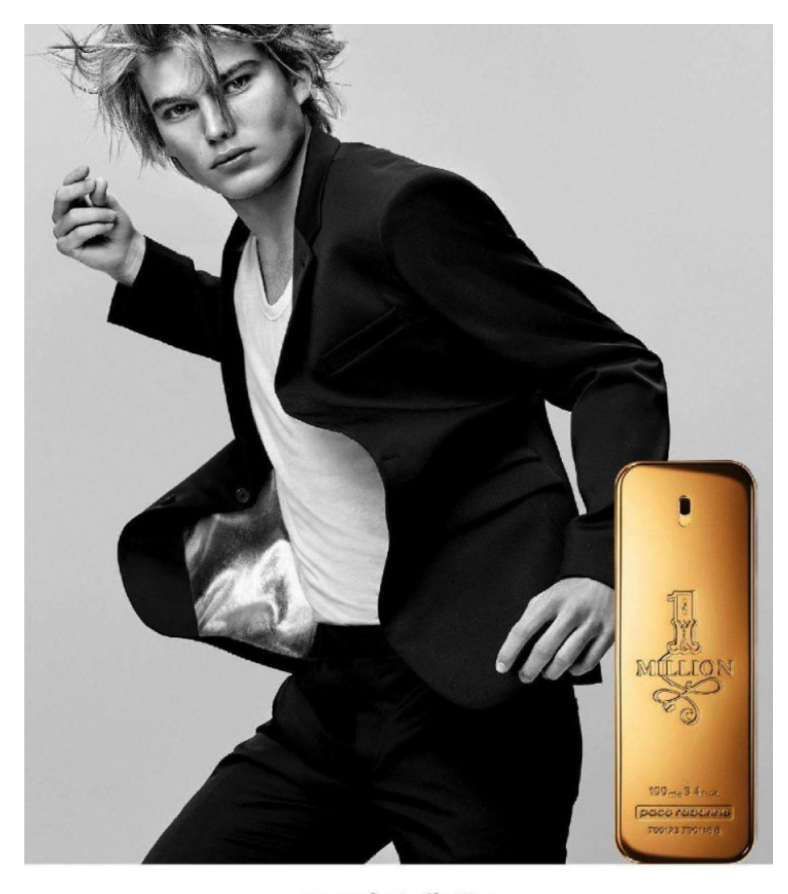
eau de toilette